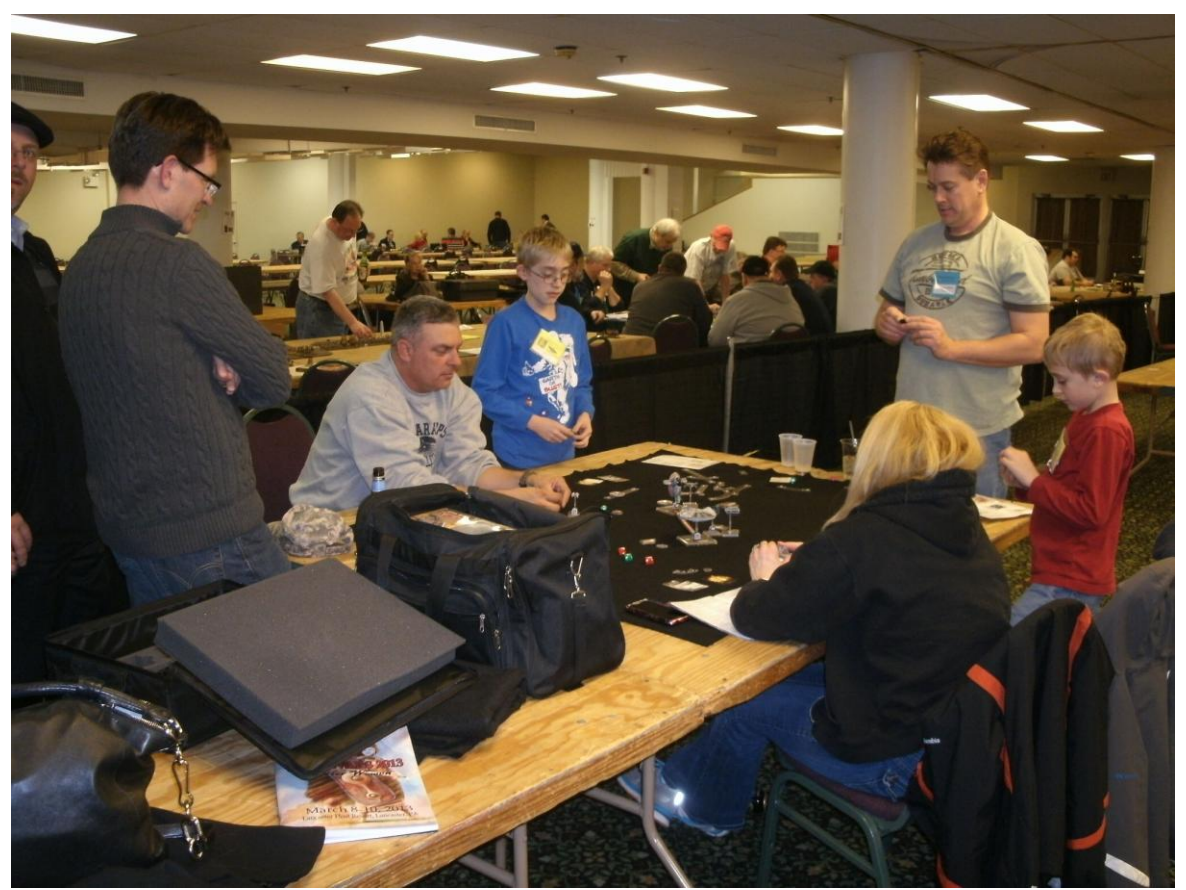
And Things Were Pretty Lively Considering That The Convention Hadn't Started