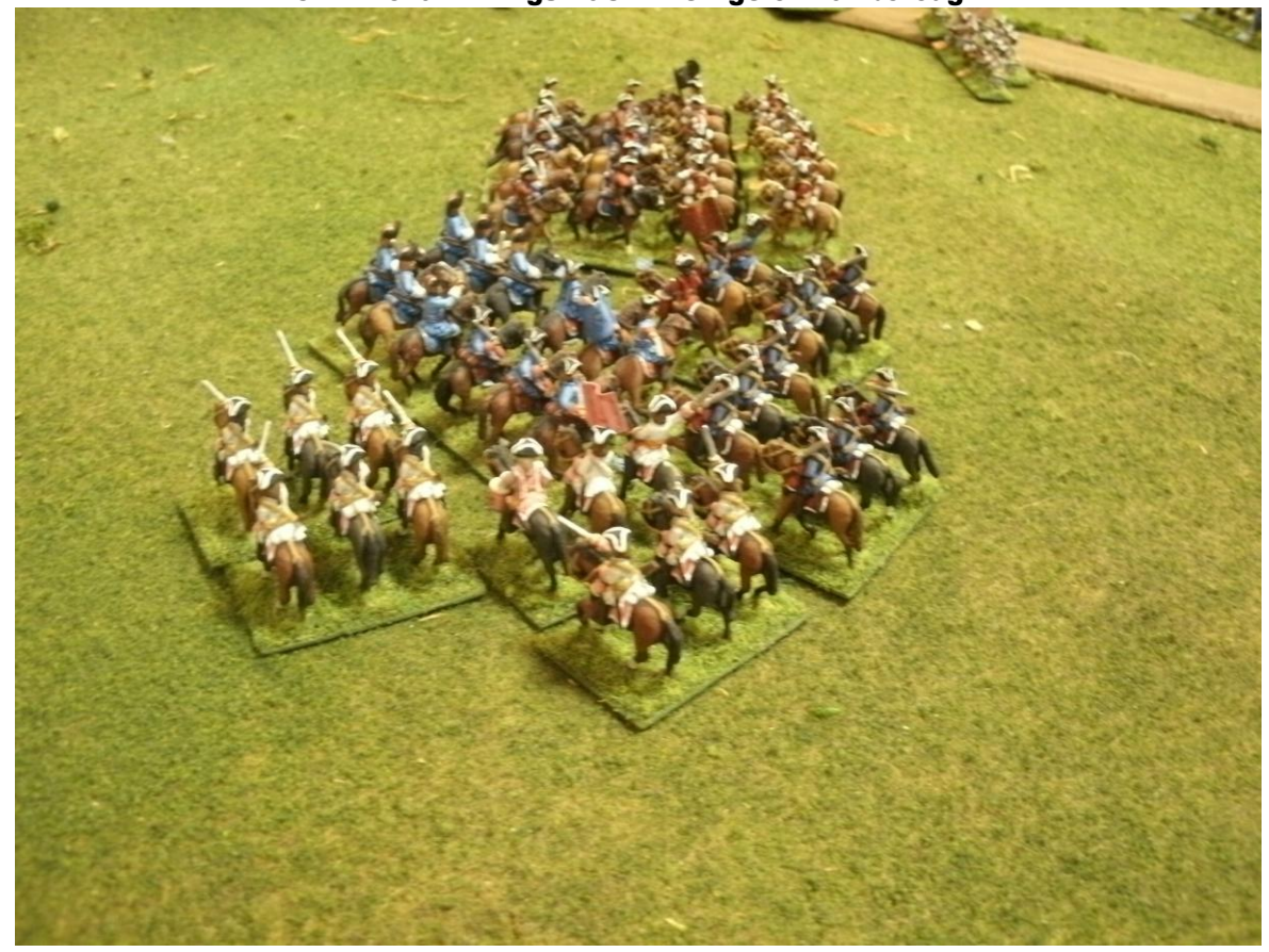
Looks Like The Blue King's Horse Guards Are In Deep Trouble