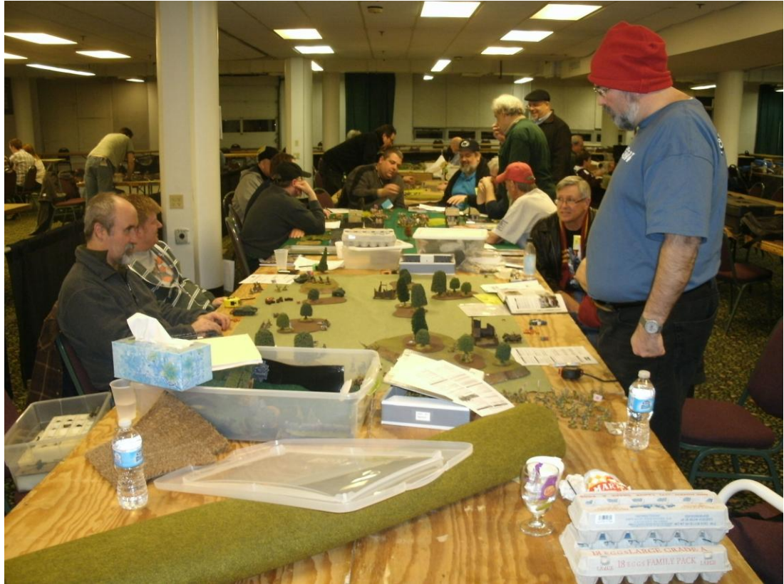
Although COLDWARS Has Reverted To A Nominal Three Day Affair After A Brief Stint As A Contractual Four Day Affair, It Still Gets A Thursday Start