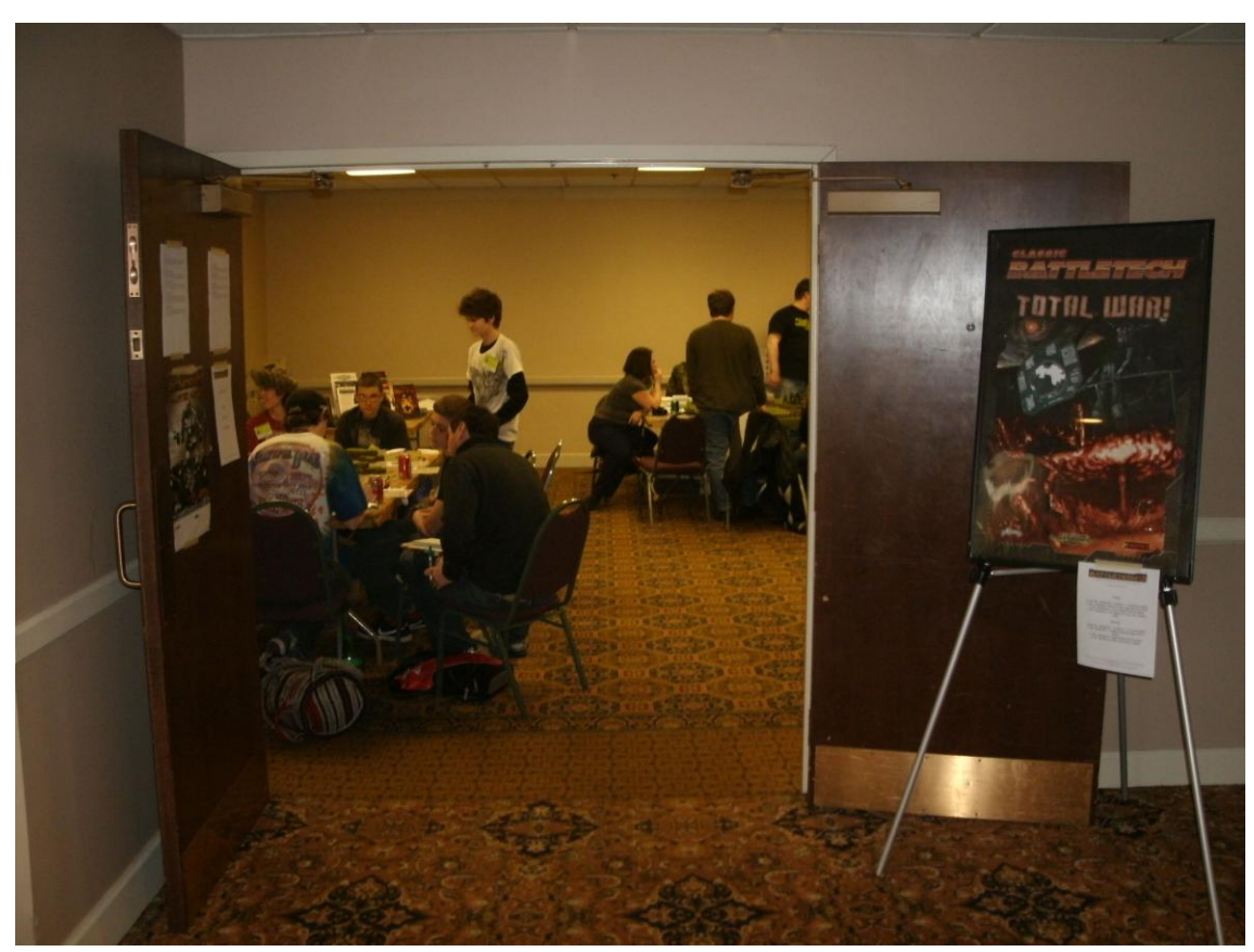
But On A More Sinister Note, The Dark Side Was Entrenched In The BATTLETECH Room