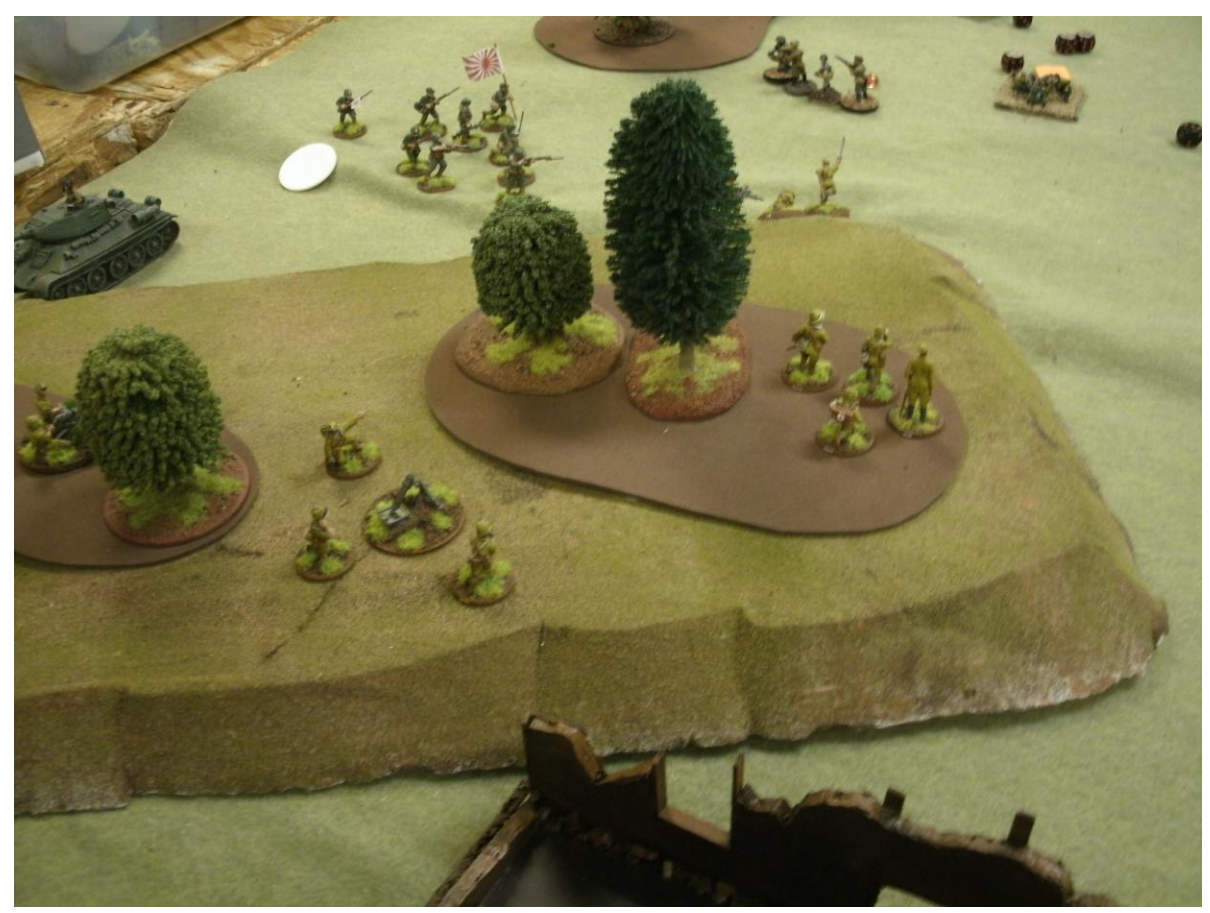
Thursday Night-Khalkin Gol 1939?-No, Looks Like A T-34/85. Must Be August 1945