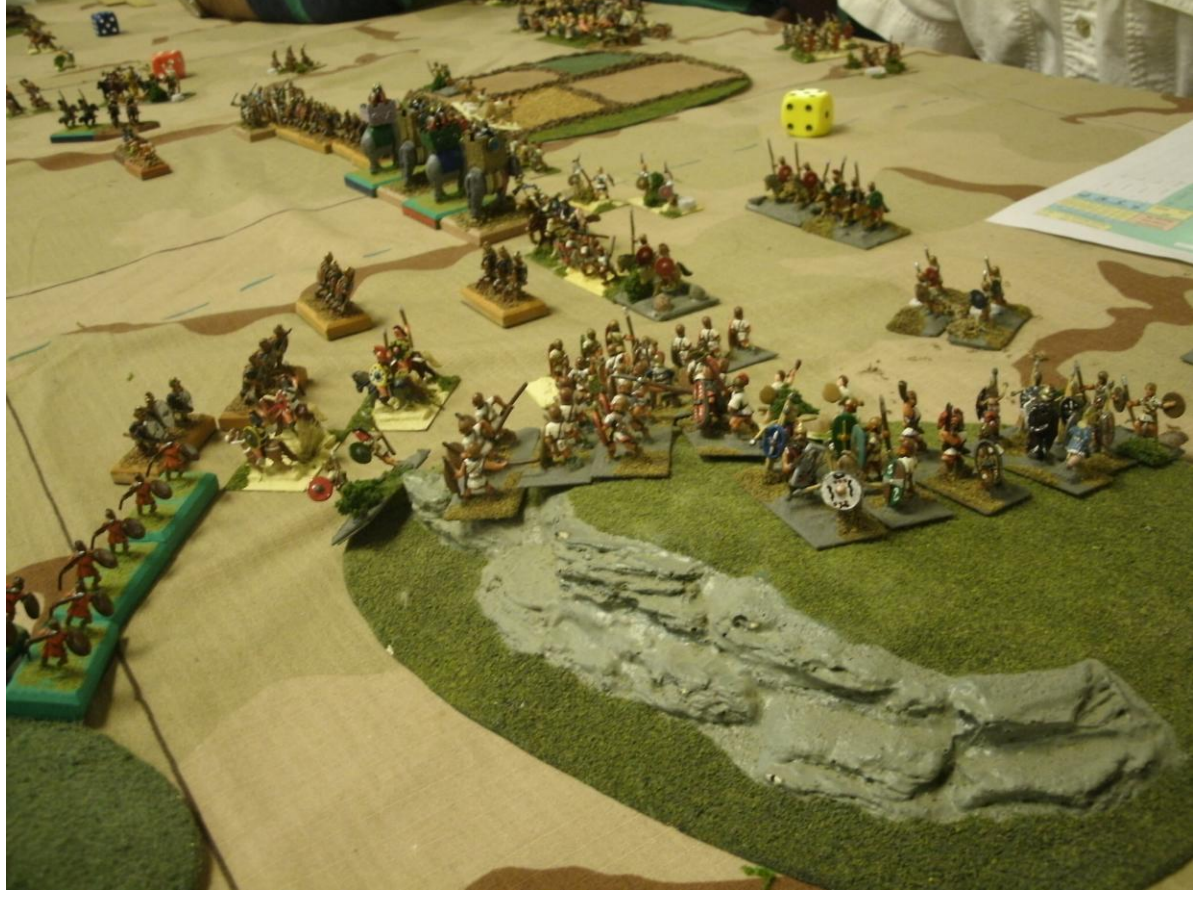
The Usual Ancients Contests Were Ongoing