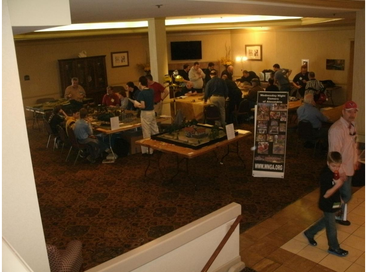
There Were Several Club Rooms, Including The Wednesday Night Adventurers of Alexandria