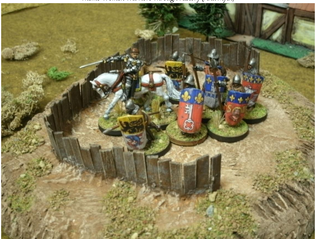
St. Joan Or The White Company? Plate Armor Obscures Gender

Theme-Women Warriors Through History (And Myth)