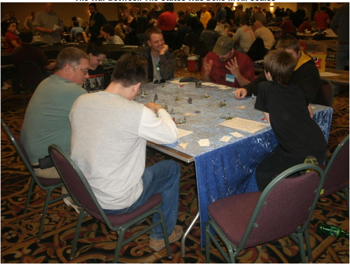
One Thing That Impressed Me Was The Crowds of Gamers Enjoying Our Hobby