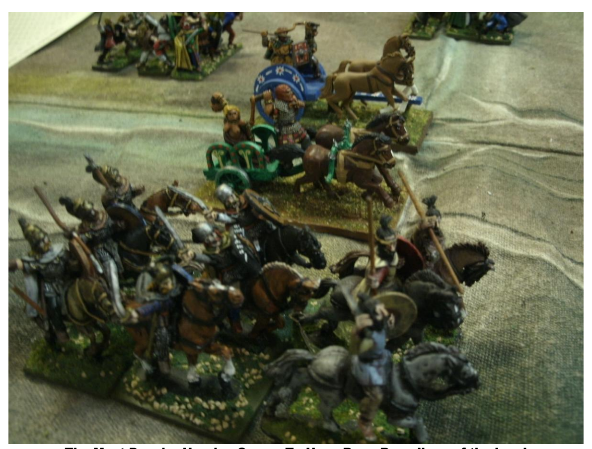
The Most Popular Heroine Seems To Have Been Bouadicea of the Iceni