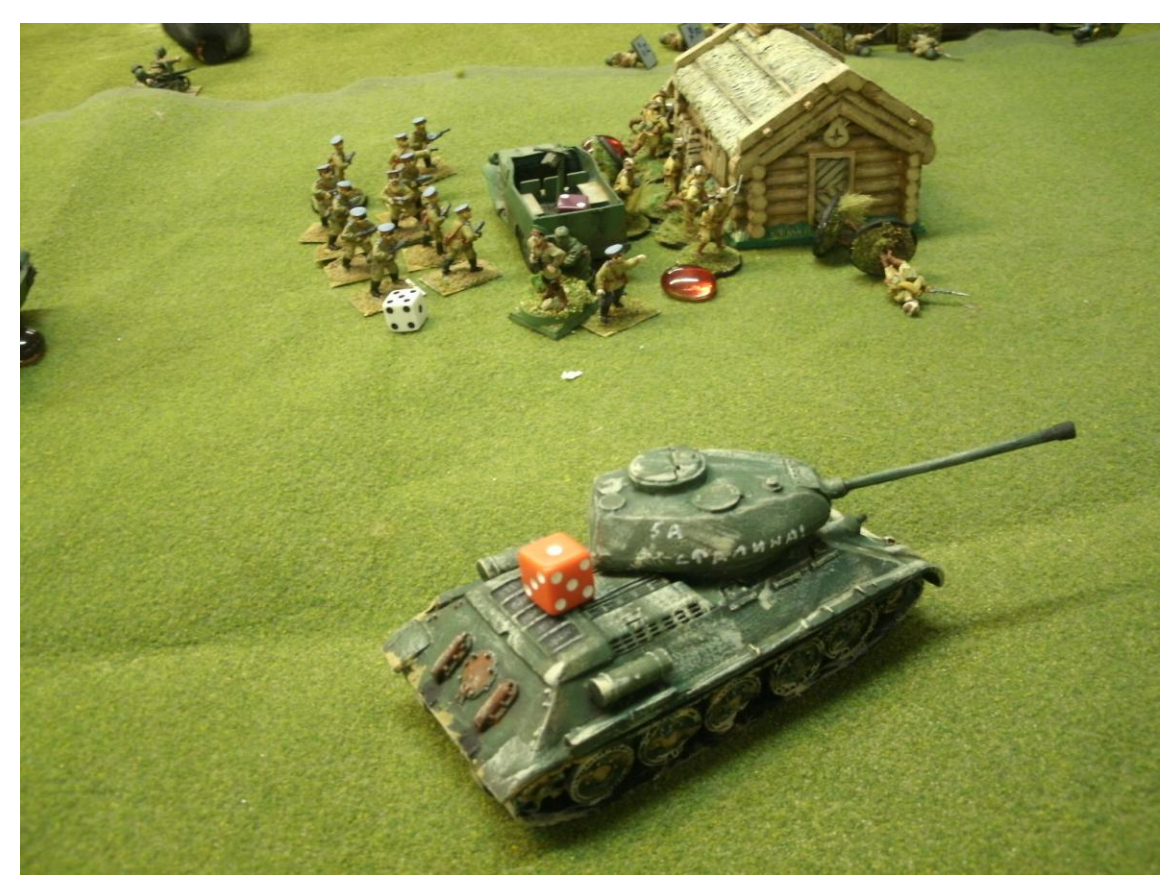
The T-34/85 Seems To Have Been The Most Popular Model In All WWII Scales