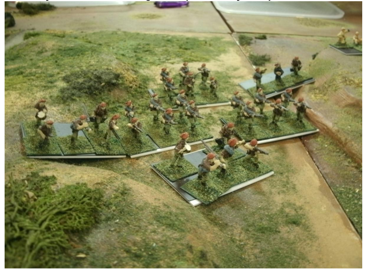
But 100 Years Later It Still Isn't Working-The King Of Spain Is Still Of The Isabelline Line Up Close-The Carlists Try Again To Enforce The Salic Law (No Luck This Time Either)