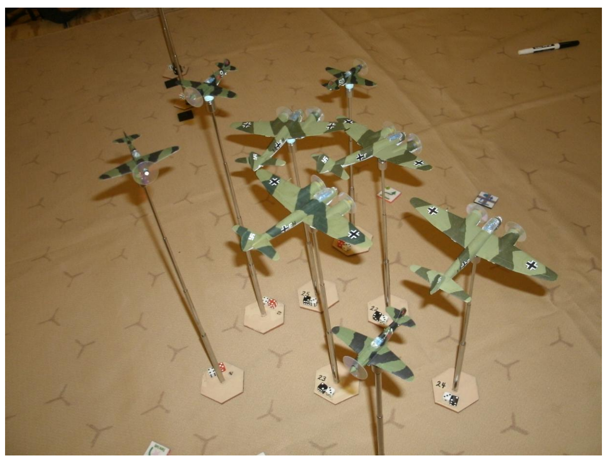
There Were Aviation Games