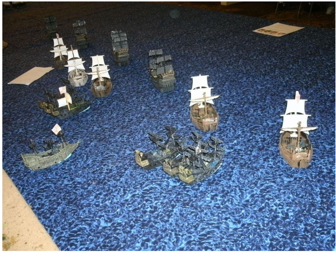
There Were Naval Games-But I'm Suspicious Of The Historical Accuracy Of This One