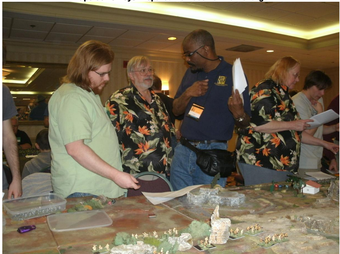
THE HMGS E-ZINE EDITORS (Hawaiian Shirts) Played The Most Recent SCW-But I Am Offended That Their Scenario Featured The Rosa Luxembourgos-Devout Communists, Fraternizing With Anarchists!