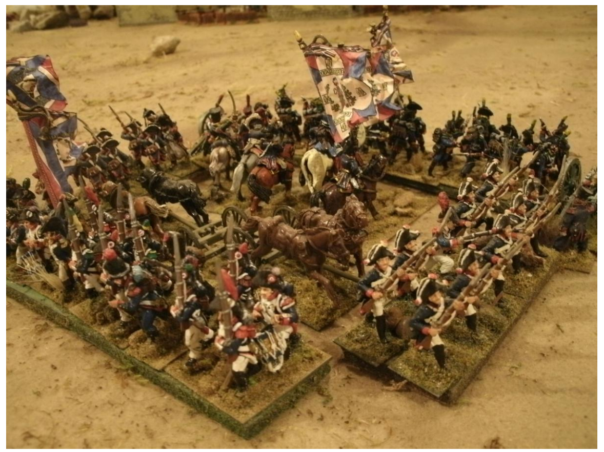
Napoleon's Boys Prepared To Receive Their Charge