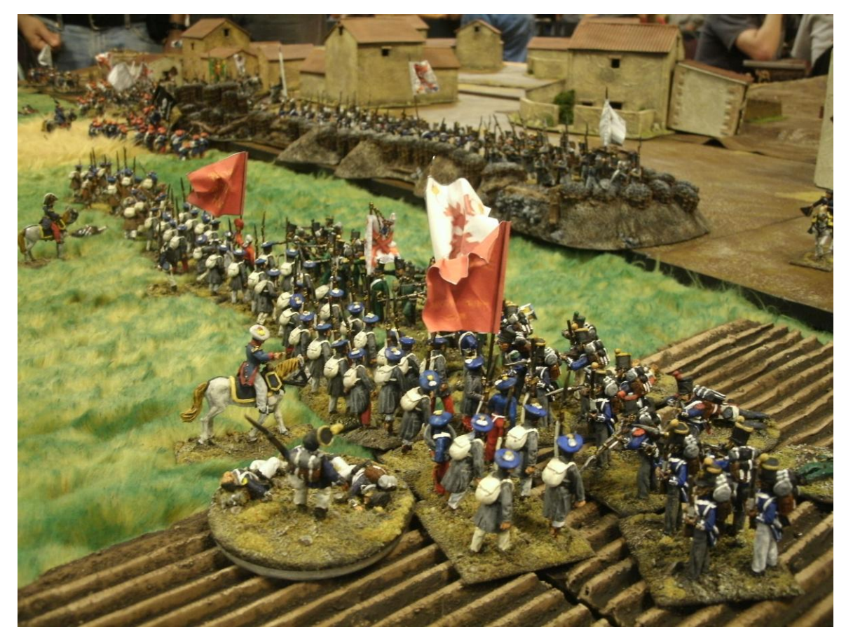
19th Century Carlist Wars Are Getting More Popular As They Attempt To Enforce Salic Law