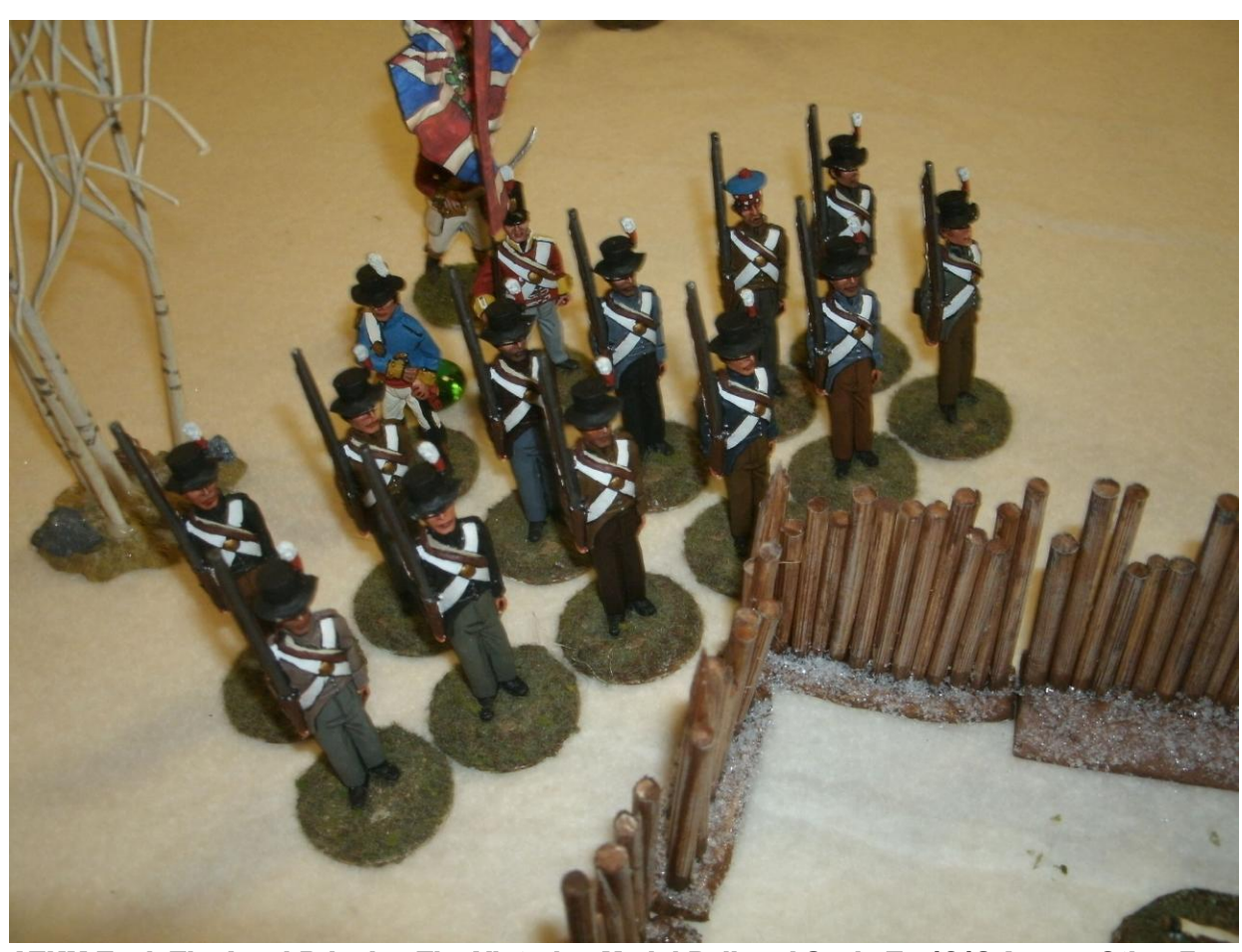
ATKM Took The Lead Bringing The Victorian Model Railroad Scale To 1812 Among Other Eras