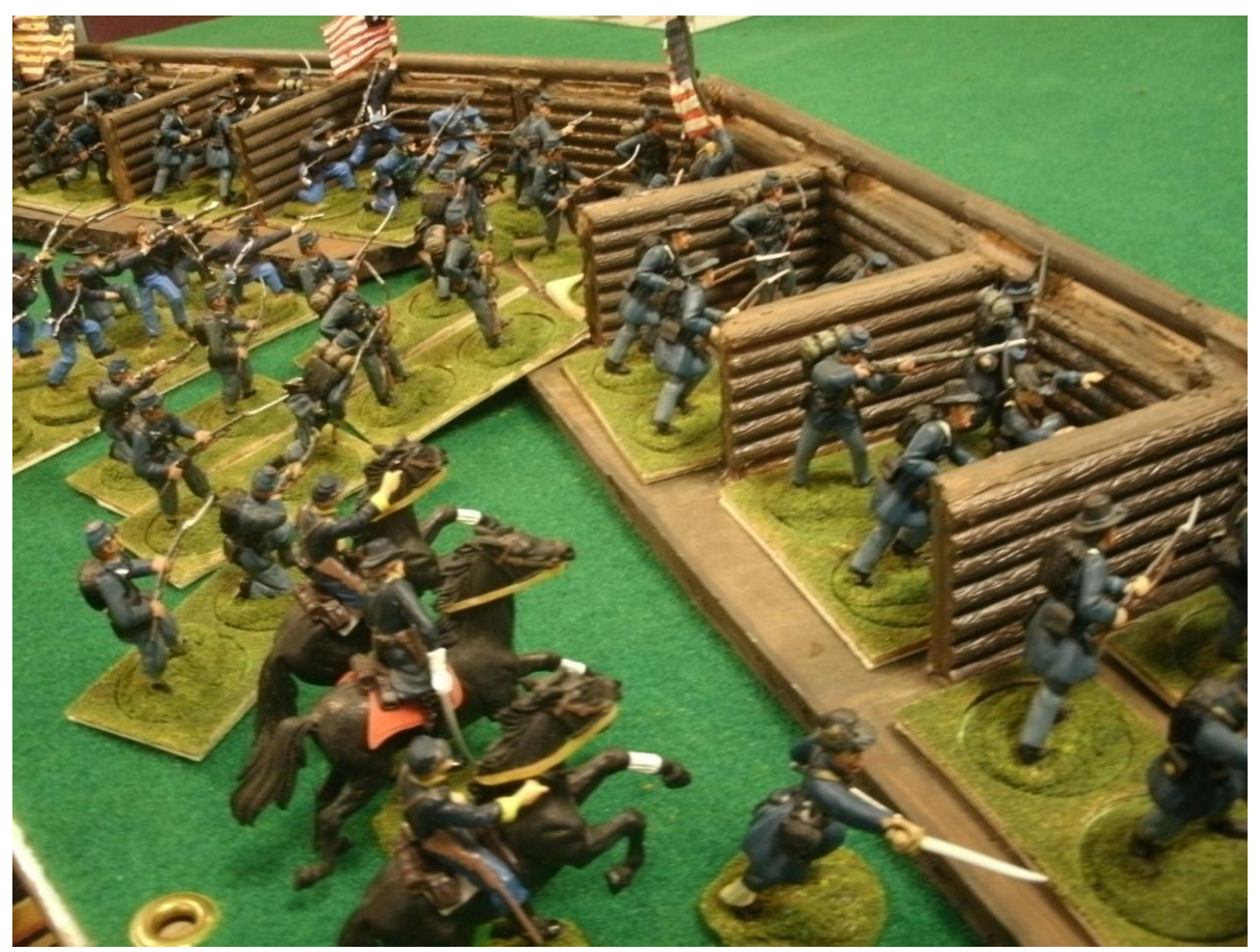
The War Between The States Was Done In All Scales