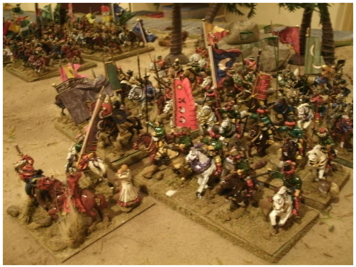
For Me The Battle Of The Pyramids Was Most Spectacular-Above, Mameluks Poised To Attack