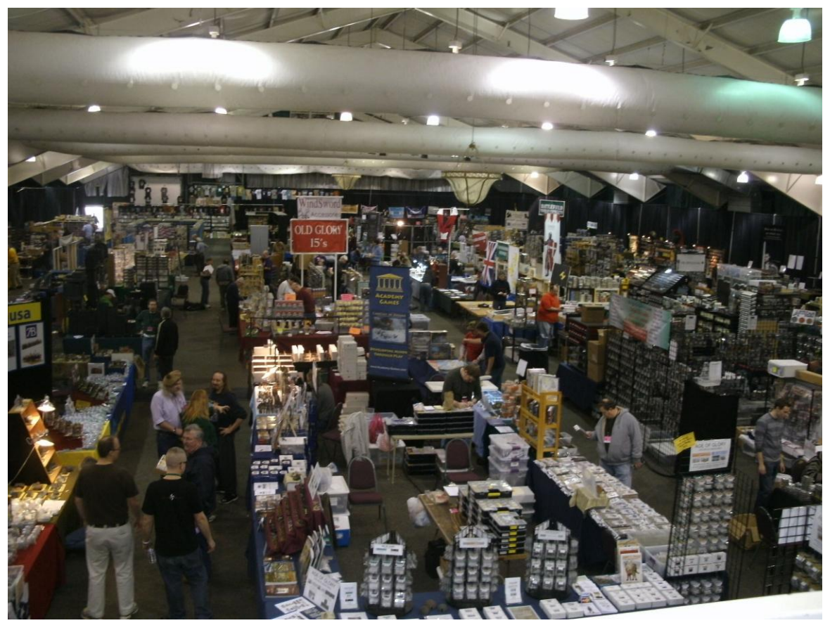
And From Noon The World's Greatest Hobby Shop Was Open-70 Name Dealers-Over 260 Tables