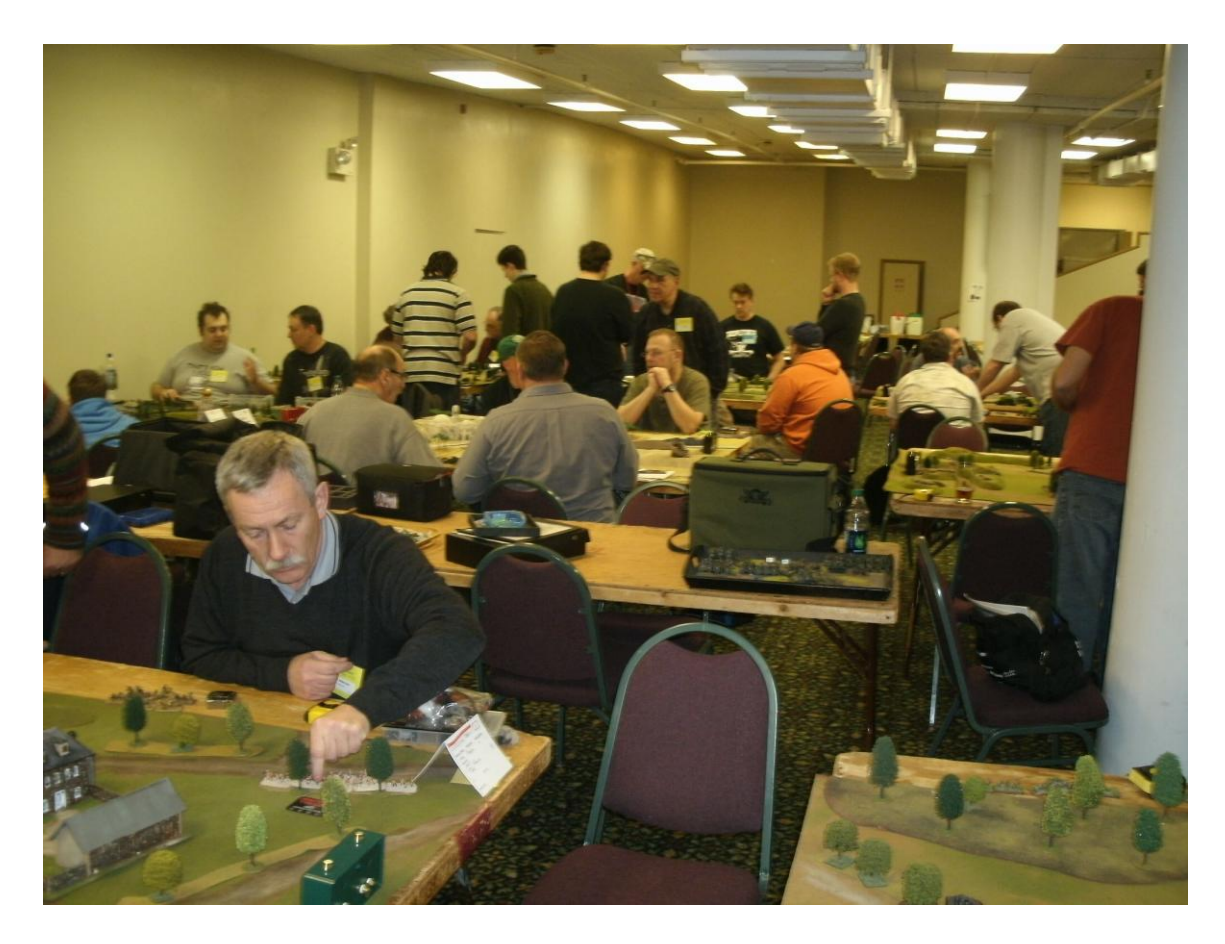
Flames Of War-One Of Many Tournaments In The Lampeter Room