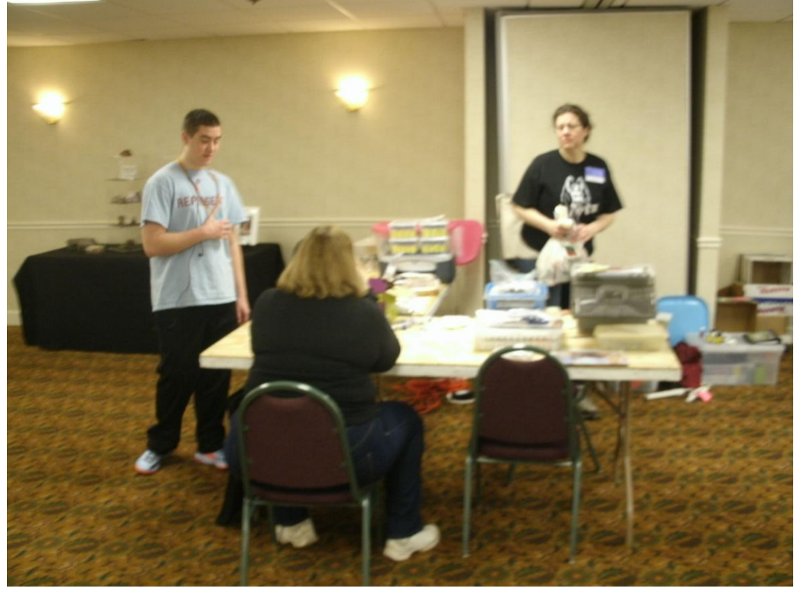
Fortunately The Painting University Provided An Educational Tone To Balance The Dark Side