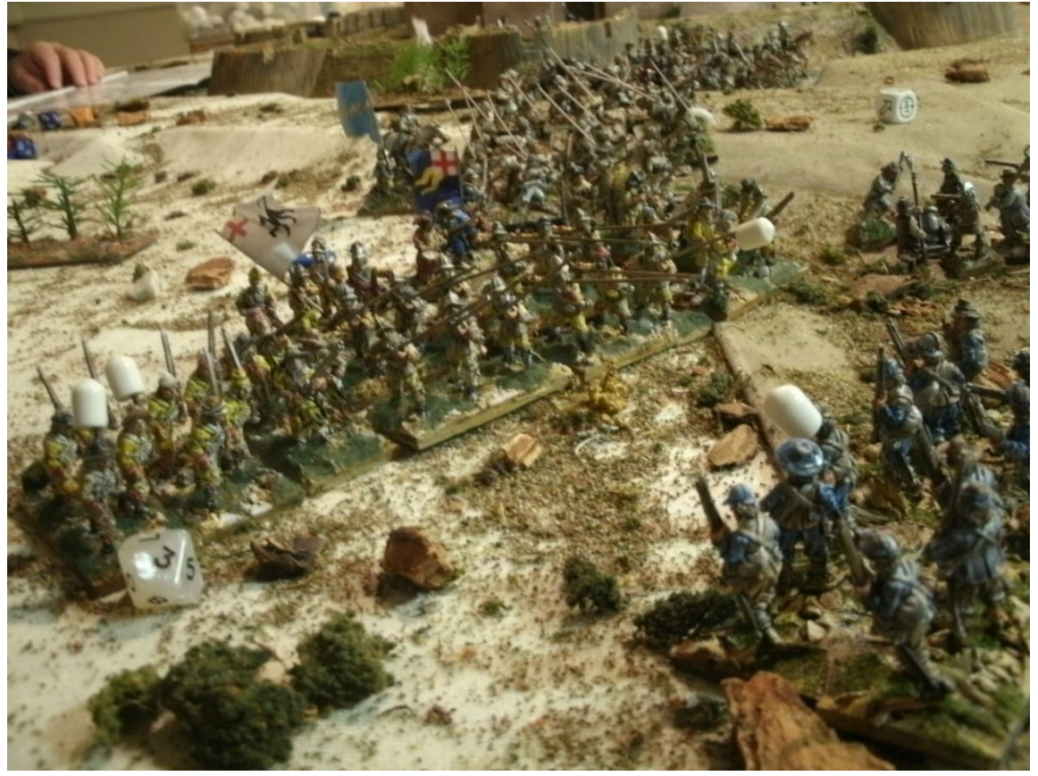
He Calls It Pike Hack. I Keep Telling Him You Don't Hack With Pikes!