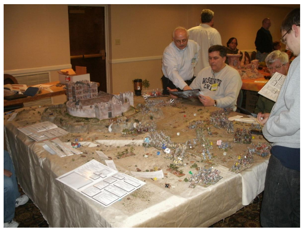
Phil Viverito's Latest Masterpiece-Siege of Basinghouse from the ECW