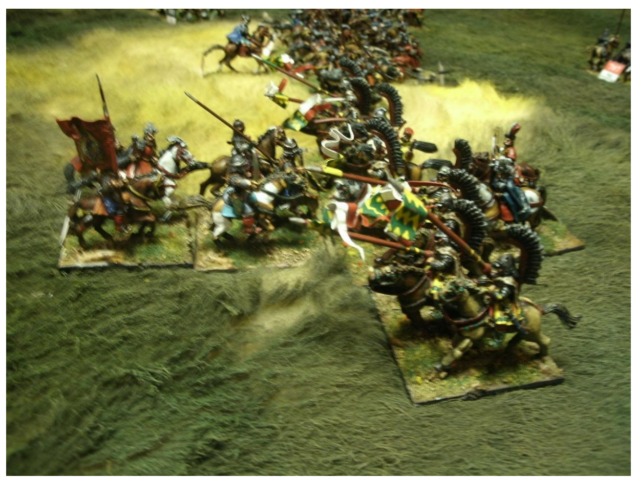
And A Spectacular Epic Of The Polish Baroque