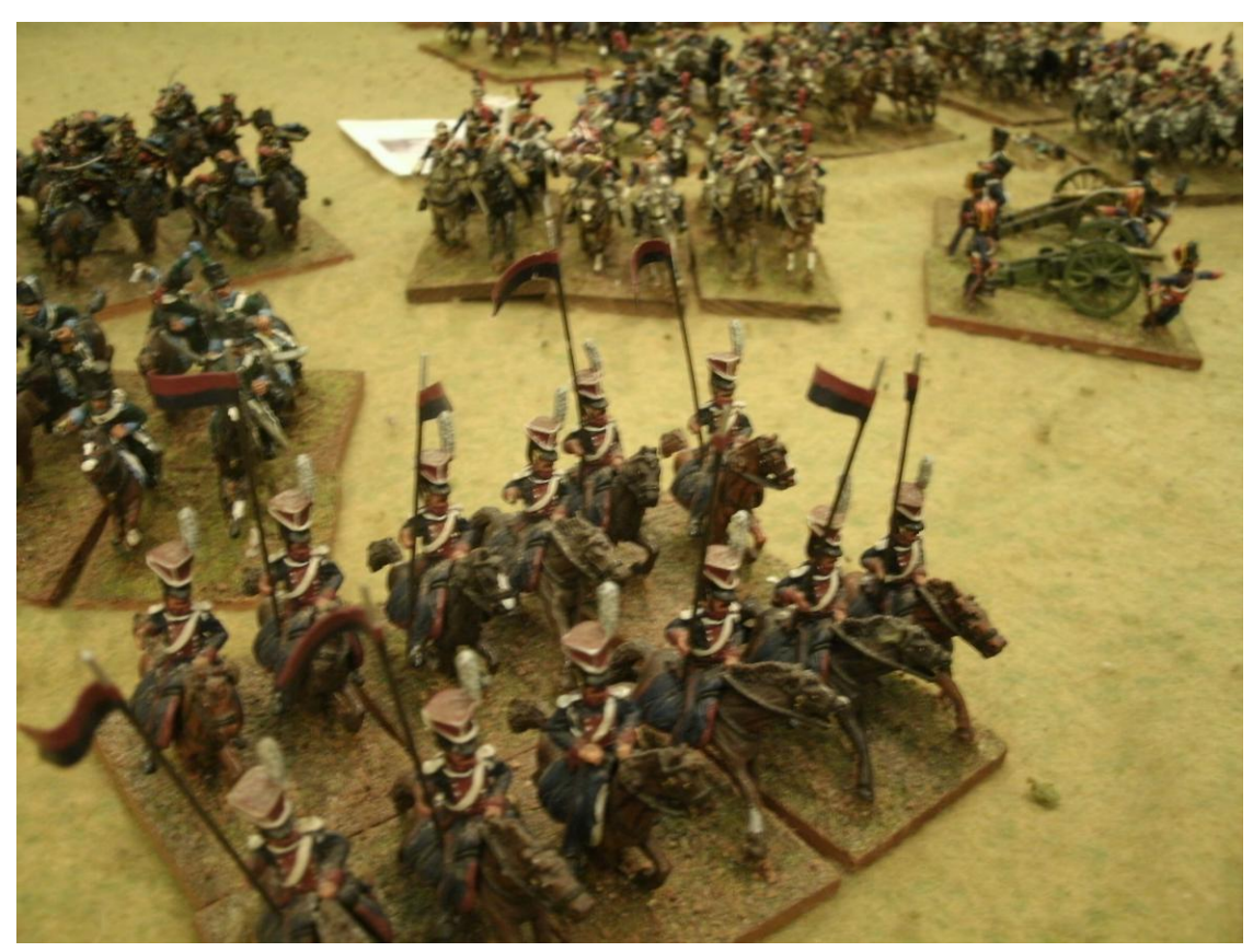
Napoleonics Were Well Represented-Though Not As Prominently As in The Early Days of HMGS