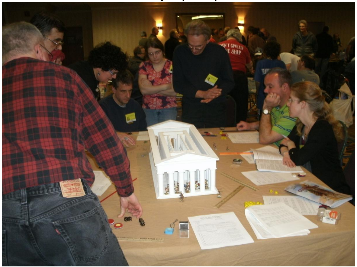
Theme Games? I Think It Was An Amazon Attack on Athens, But I'm Not sure